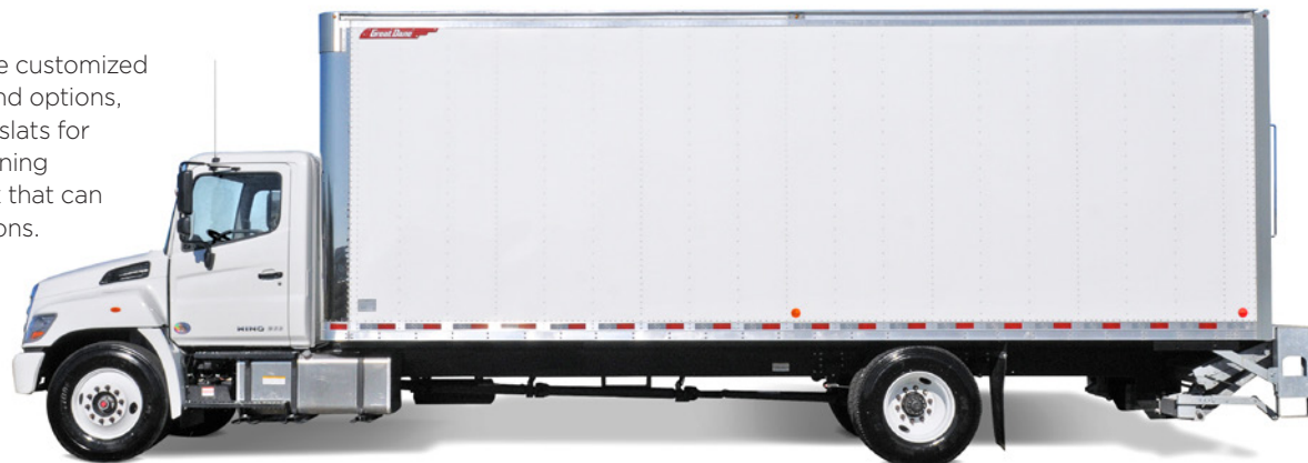
Shown with optional Maxon Tuk-A-Way Lift.

The Sahara S-Series can be customized with an array of features and options, including horizontal wood slats for flexible load securement, lining materials and logistic track that can be placed in various positions.